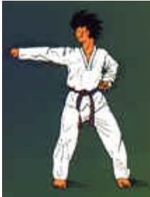
chumok yop jirugui