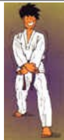
sonnal okgorro are maki