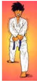
okgorro are maki