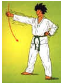
me chumok neryo chigui