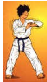
yop palkup chigui