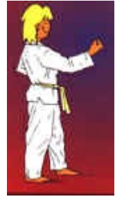
montong an maki