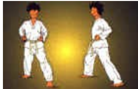
ap kubi sogui