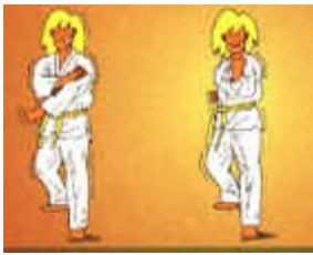
an palmok montong maki