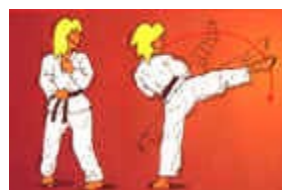
mondollyo furio chagui