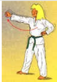
dung chumok bakat chigui