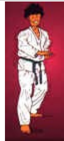
pyon son kut seuo chirugui