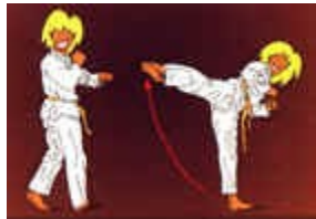
mondollyo yop chagui