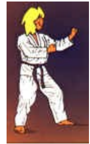
goduro montong maki