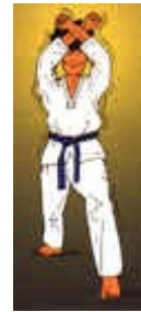
okgorro olgul maki