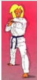
dollyo palkup chigui