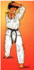
chebi pum mok chigui