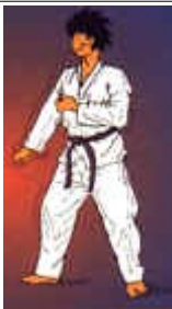
oduro are maki