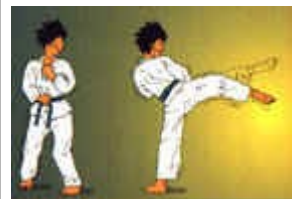
mondollyo nako chagui