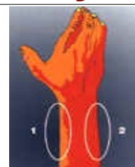
1.- an palmok 2.- bakat palmok