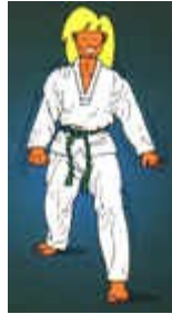
guechio are maki