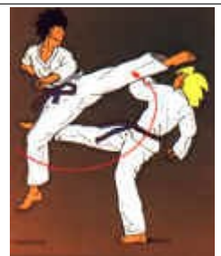
tuio mondollyo nakko chagui