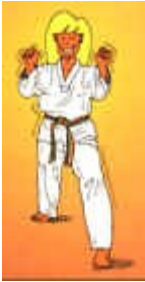
bakat palmok guechio montong maki