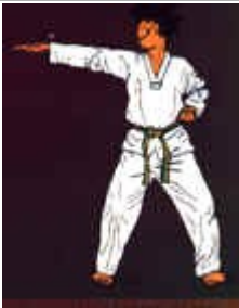
jansonnal olgul bakat chigui