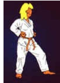
tuit kubi sogui