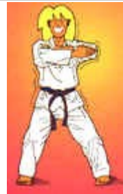
palkup piochok chigui