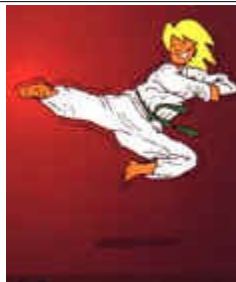
tuio chop chagui