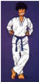
ap koa sogui