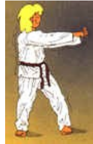
chumok piochok jirugui