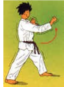
dangkio tok jirugui