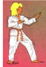
sonnal montong maki