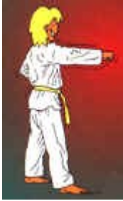
chumok montong bande jirugui