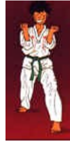
an palmok guechio montong maki