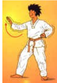
jansonnal montong maki