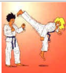
mondollyo tuit chagui