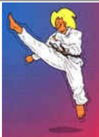
tuio ap chagui