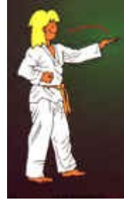
Jansonnal (an/mok) chigui