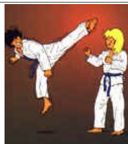
tuio mondollyo yop chagui